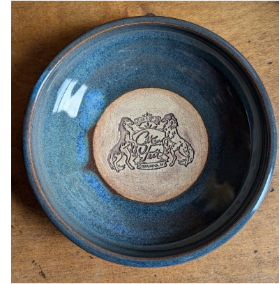
Trinket Dishes by Stone Pony Pottery

Best of Breed - Sports Chair and BOB Plaque